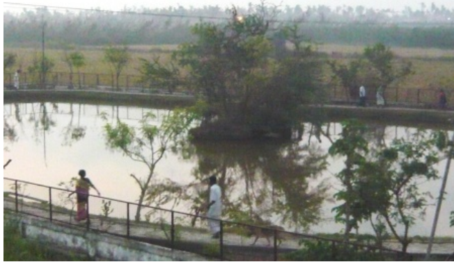
Morning brisk by Residents of TEV