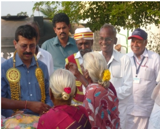
District Collector Visited for distributed relief to Thana In TEV