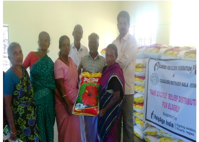
Thane cyclone relief Materials distribution activity – by Efe Director and Chairman -