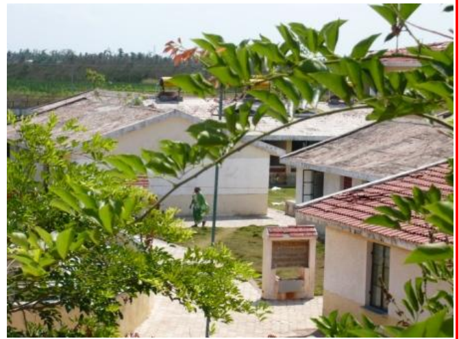
After thane cyclone – The trees started growing